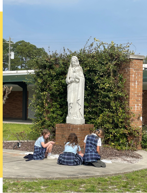
A great morning for Math and Mother Mary!

Saturday, March 9: Brite Stars at 7 PM hosted by Emerald Coast Harley Davidson